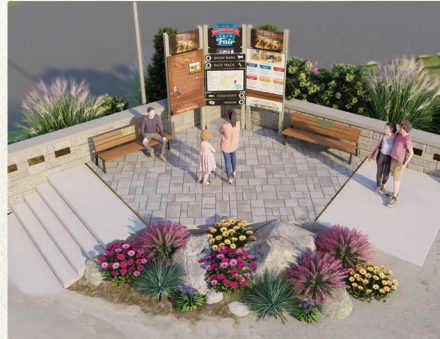
Rendering is representation of Memorial Plaza